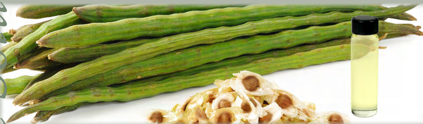
Moringa pods, seeds and oil