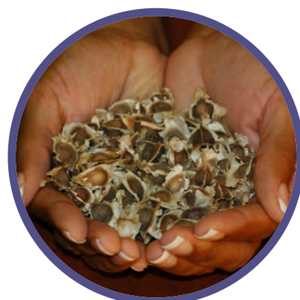
Hand Picked Moringa Seeds