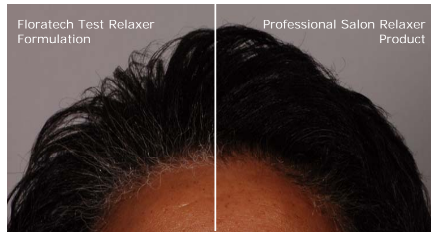
Post-treatment following relaxation, neutralization, and conditioning

Hair samples taken at: 1. baseline (non-treated) ; 2. post-professional salon relaxer treatment ; and 3. post-Floritech test relaxer formulation treatment.