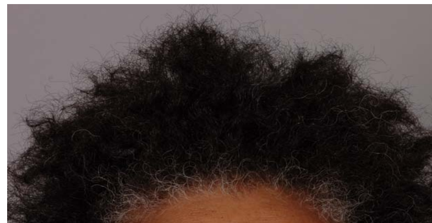
Virgin African American hair before relaxer treatment

*The baseline tensile strength was 161 MPa.